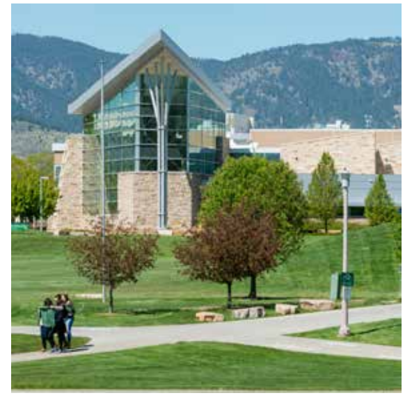
Student Recreation Center

Dining on Campus Durrell Center Ram's Horn Dining Center Aspen Grille – Lory Student Center